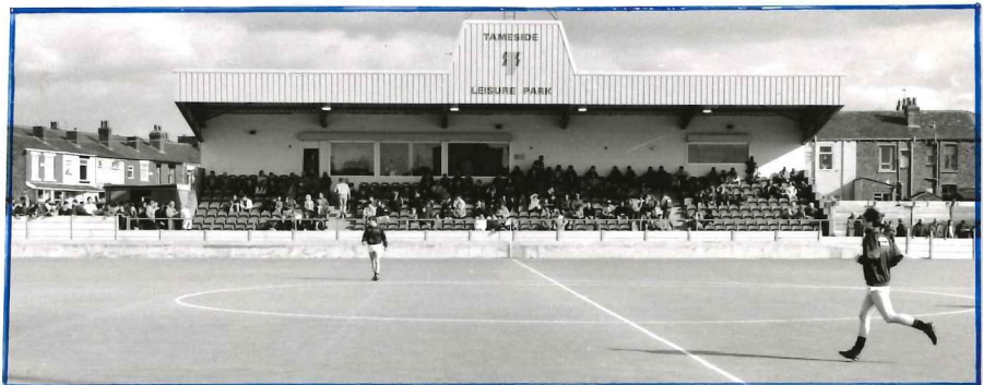
AND THEN COMPLETE THE FOLLOWING; "I THINK HYDE UNITED SHOULD BE THROWN DUT OF ALL F A COMPETITIONS AND THEIR FITCH ROLLED UP AND THROWN IN THE MANCHESTER SHIP CANAL BECAUSE,,,,," ONE BUNCH OF SOUR GRAPES AND TEAR STAINED PROGRAMME TO THE WINNER